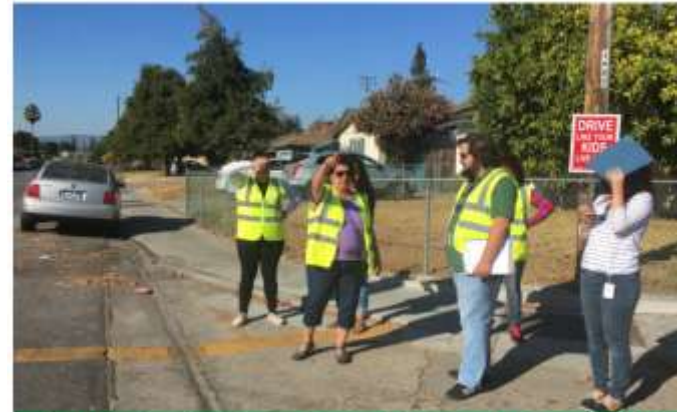
Recomendaciones Para Mejorar la Seguridad Peatonal y Ciclista Para la Comunidad San José McKinley-Bonita