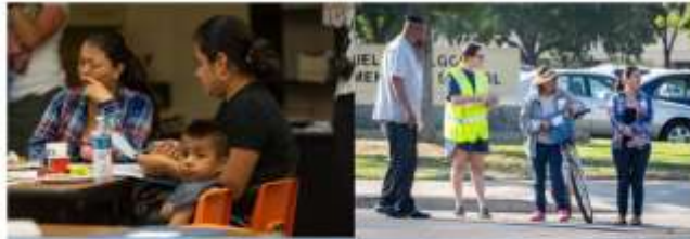
Recommendations to Improve Pedestrian & Bicycle Safety for the Miguel Hidalgo Elementary School Community in Fresno